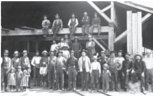
Mill crew and children, Yale-Columbia Lumber Col. 1898 VPL 2280.