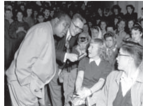
ABOVE: CJOR broadcasting "Teen Theme" program live. Louis Armstrong guest, 1954

The VHS meets September-November and January-May on the last Thursday of the month at 7:30 pm at the Vancouver Museum.