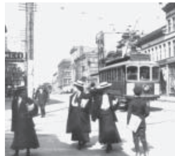
Schoolgirls and a paper boy with a streetcar, 1906. Looking North on Granville from Robson, VPL 82431.