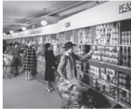
Remember dressing up to go shopping? Woodward's Food Floor, 1941, VPL 2280.