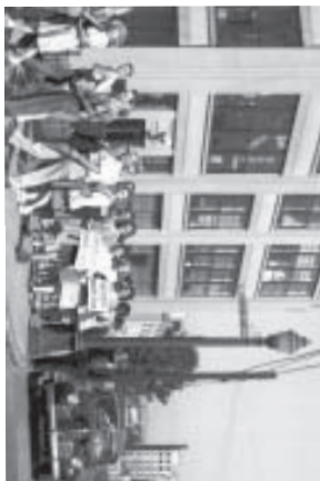
ABOVE: The United Steel Workers picketing outside American Can Company in 1945 (VPL 26709) underscoring the benefits of membership.