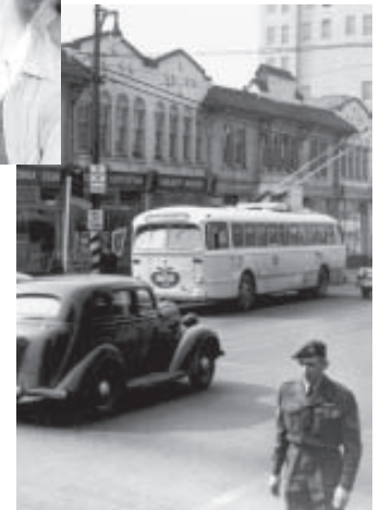
BELOW: SE Corner of Seymour and Georgia, 1952, VPL 81829A