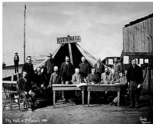
Re-creation of Vancouver City Council meeting after the 1886 Great Fire about two months after the city's incorporation. Photo courtesy of Vancouver Public Library VPL Accession #1089A.

We're looking forward to seeing you there!