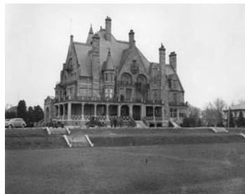
LEFT: Craigdarroch Castle in Victoria

walking tour. The awards ceremony and banquet will be on Saturday night. For more information on the BCHF conference, registration forms and complete program details, visit their website at: www.bchistory.ca and click on Conferences.